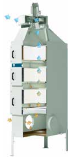
This picture illustrates the drainage process in our FibreDrain® filters.

The airstream enters at the bottom of the filter unit and passes upward through the filter cartridges. The filter stack is progressive in filtration properties, which means that the smaller the particle, the further it will penetrate the filters in the air flow direction. The captured mist drains from the filter surface by gravity down in the sump of the collector.